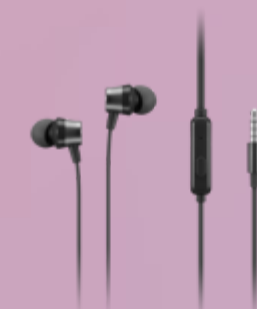
Lenovo Analog In-Ear Headphones Gen II Bulk Package 4XD1T54899

Please click here to view the full list of accessories.