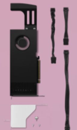
NVIDIA RTX PRO 4000 Blackwell 24GB DP*4 GDDR7 4X61T95636