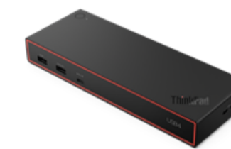
ThinkPad USB4 Dock 5000 40BF0100UK