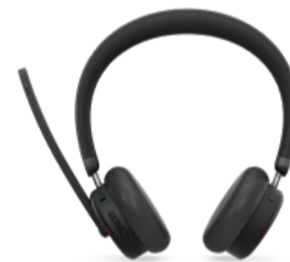
Lenovo Dual-Mode Wireless ANC Headset 6550 (USB-C, Teams) 4XD1S19778