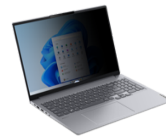
Lenovo 16-inch Premium Clarity Privacy Filter for ThinkBook 16 Gen 4 (16:10) 4XJ1U03940