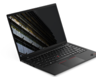
Lenovo 14-inch Premium Clarity Privacy Filter for X1 Carbon Gen9 (16:10)