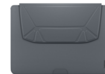
Lenovo Origami 14" X9 Sleeve