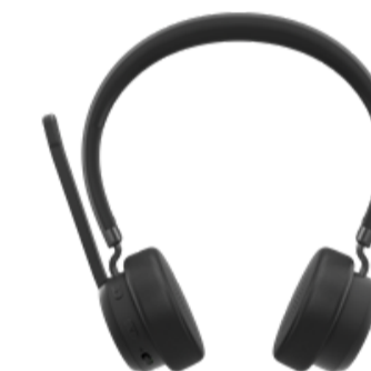
Lenovo Wireless VoIP Headset (Teams)