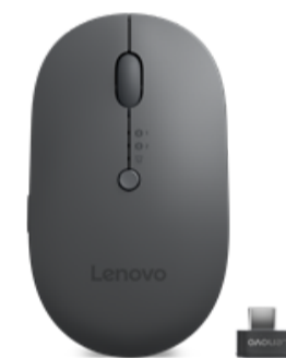
Lenovo Multi-Device Wireless Mouse (X9 Edition)