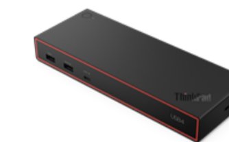
ThinkPad USB4 Dock 5000