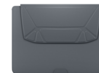
Lenovo Origami 15" X9 Sleeve