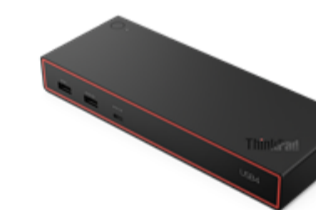
ThinkPad USB4 Dock 5000