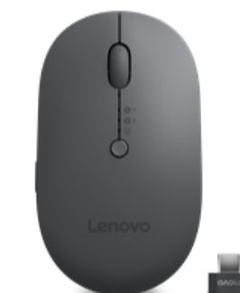
Lenovo Multi-Device Wireless Mouse (X9 Edition)