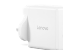
Lenovo Dual USB-C 65W GaN Charger