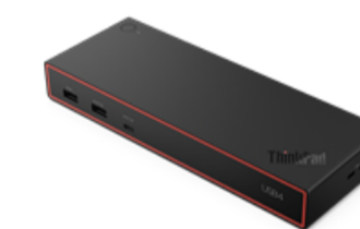
ThinkPad USB4 Dock 5000 40BF0100UK