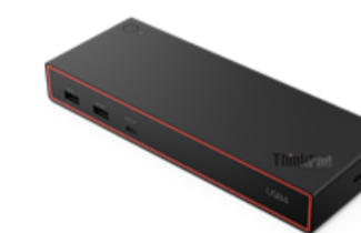
ThinkPad USB4 Dock 5000 40BF0100UK