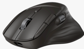
HP Ultra-Fast-Scroll Wireless Mouse 780M B8YX3AA