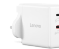
Lenovo Dual USB-C 65W GaN Charger