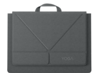
Lenovo Yoga Tote Sleeve (14" Grey)