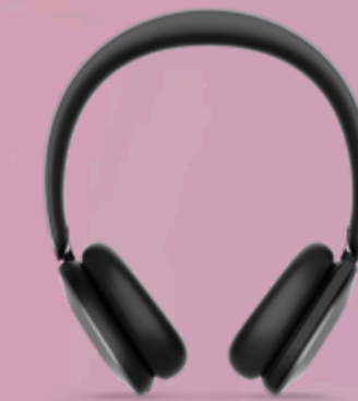
ThinkPad Dual-Mode Wireless ANC Foldable Headset 8550 (Aura Edition) - USB-C, Teams 4XD1T60925