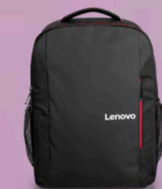
Lenovo 16" Laptop Everyday Backpack B510 4X41U80414

Please click here to view the full list of accessories.