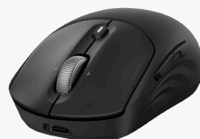
HP 700 Rechargeable Wireless Mouse A27B0AA