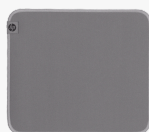
HP 100 Sanitizable Mouse Pad 8X594AA