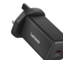
Lenovo 65W Mini USB-C GaN Charger