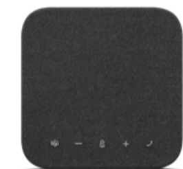
Lenovo Wireless Speakerphone 6000