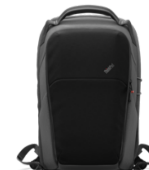
ThinkPad 16" Click-Go Backpack (Aura Edition)