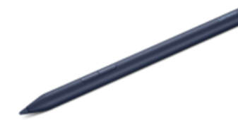
Lenovo Pen 2 - Cosmic Blue