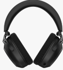
HyperX Cloud Alpha 2 - Wireless Gaming Headset AJ5C7AA