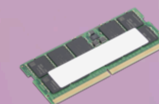
ThinkStation 48GB DDR5 6400MT/s ECC CSoDIMM Memory 4X71U70409

Please click here to view the full list of accessories.