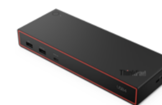
ThinkPad USB4 Dock 5000 (with 135W Adapter) 40BF0135EU