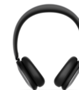
ThinkPad Dual-Mode Wireless ANC Foldable Headset 8550 (Aura Edition) - USB-A, ... 4XD1V23301