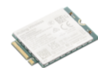
ThinkPad Rolling Wireless RW101R-GL SDX12 4G USB M.2 3042 module for CS2627 4XC1V64418