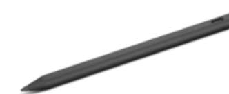
Lenovo Yoga Pen - Black 4X81U29637