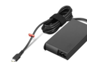
ThinkPad Mobile Workstation 140W USB-C GaN Slim AC Adapter-UK 4X21U28822