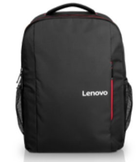
Lenovo 16" Laptop Everyday Backpack B510