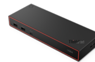
ThinkPad USB4 Dock 5000