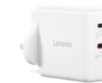
Lenovo Dual USB-C 65W GaN Charger