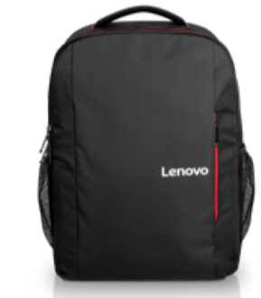
Lenovo 16" Laptop Everyday Backpack B510