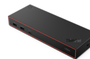
ThinkPad USB4 Dock 5000