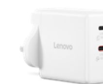
Lenovo Dual USB-C 65W GaN Charger