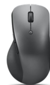
Lenovo Professional Bluetooth Rechargeable Mouse 4Y51J62544