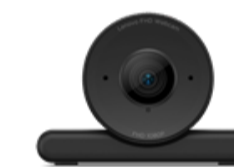
Lenovo FHD Webcam 4XC1Q44952