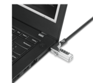
Combination Cable Lock from Lenovo 4XE1F30278