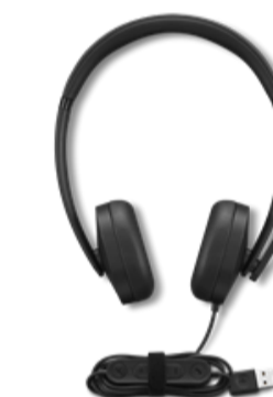
Lenovo USB-A Wired Stereo Headset Gen 2 4XD1P83425