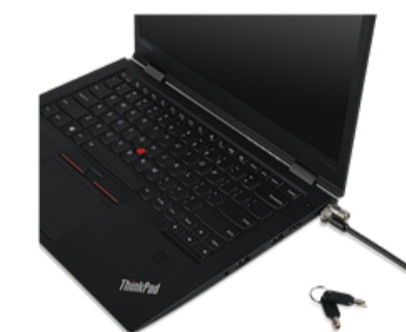
Kensington MicroSaver 2.0 Cable Lock from Lenovo 4XEON80914