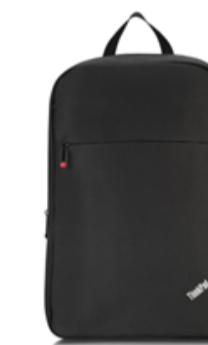
ThinkPad 15.6-inch Basic Backpack 4X40K09936