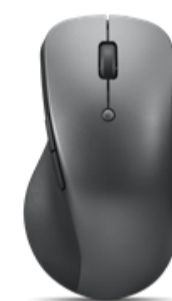
Lenovo Professional Bluetooth Rechargeable Mouse 4Y51J62544