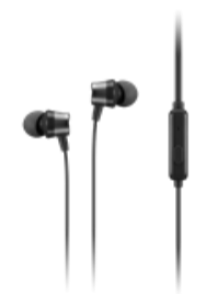
Lenovo Analog In-Ear Headphone Gen II 4XD1J77352