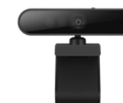
Lenovo Performance FHD Webcam 4XC1D66055