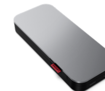
Lenovo Go USB-C Laptop Power Bank (20000 mAh) 4OALLG2WWW