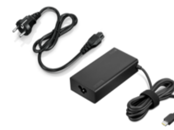
Lenovo USB-C 100W AC Adapter-DK