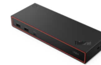
ThinkPad USB4 Dock 5000 (with 135W Adapter)