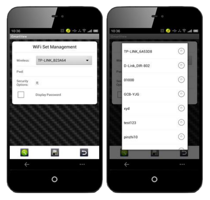
Tips: Only B series and L series don't support WEP encryption.