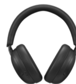
Lenovo Wireless Headphone 2000