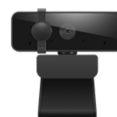
Lenovo Essential FHD Webcam Gen2