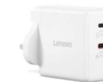
Lenovo Dual USB-C 65W GaN Charger