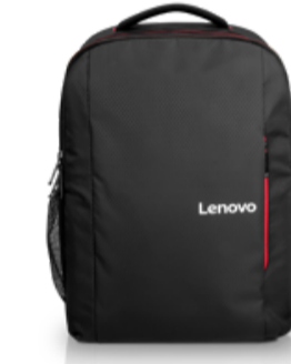
Lenovo 16" Laptop Everyday Backpack B510