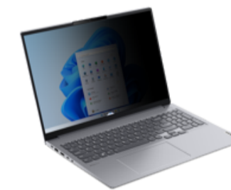
Lenovo 16-inch Premium Clarity Privacy Filter for ThinkBook 16 Gen 4 (16:10)