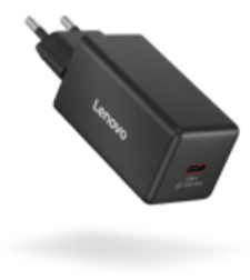
Lenovo 65W Mini USB-C GaN Charger GOA665WBEU