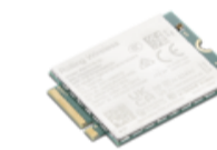
ThinkPad Rolling Wireless RW101R-GL SDX12 4G USB M.2 3042 module for CS2627 4XC1V64418