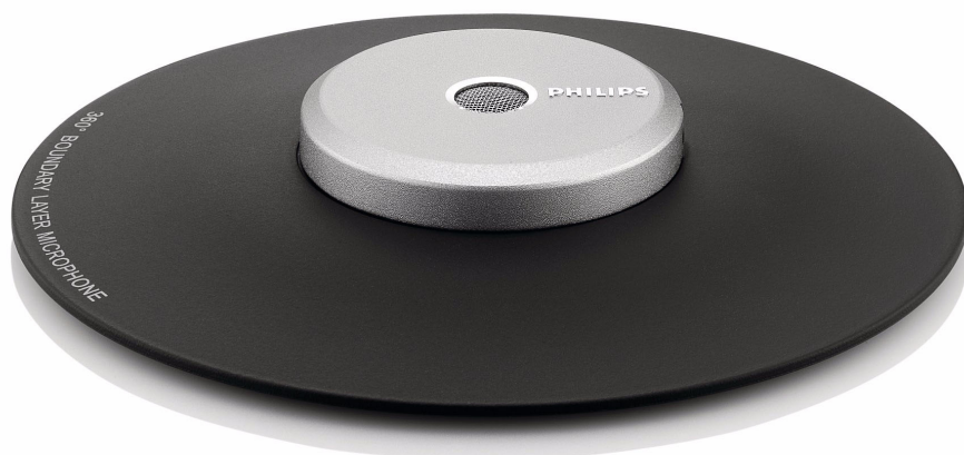
Philips Meeting microphone