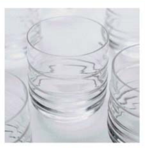
Οδηγίες χρήσης Instrukcje użytkowania Használati utasítás Инструкция за използване הוראות שימוש