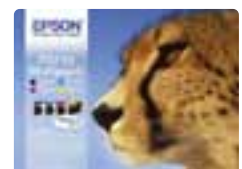
Recommended ink cartridges**