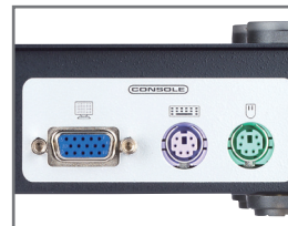
■ PS/2 console support (KA9222A)