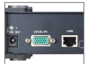
■ USB local computer support (KA9272A)