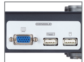
■ USB console support (KA9272A)