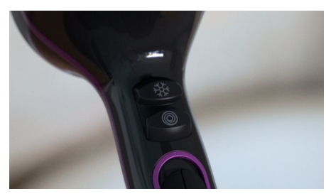
The turbo boost button increases the airflow, to dry your hair even quicker.