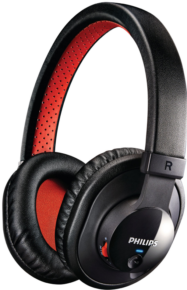
Philips Bluetooth stereo headset