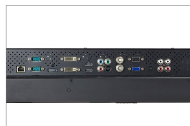
Mutiple video inputs (VGA, DVI, HDMI, BNC, S-Video, DisplayPort and Component) allow for effortless system integration