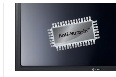
Anti-Burn-in™ technology prevents image sticking