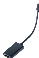
mini DisplayPort to HDMI 3D cable