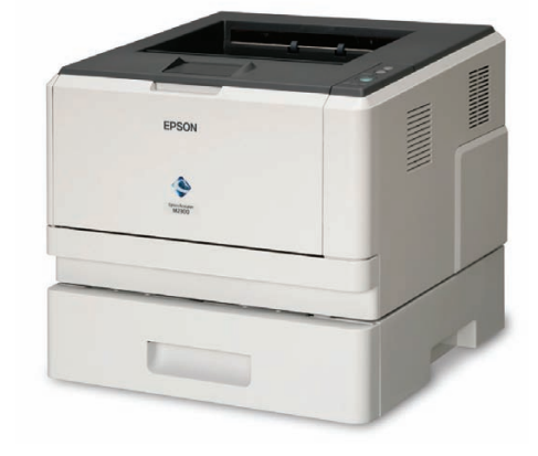
The AcuLaser M2300DTN has an Ethernet interface and an additional 250-sheet paper tray