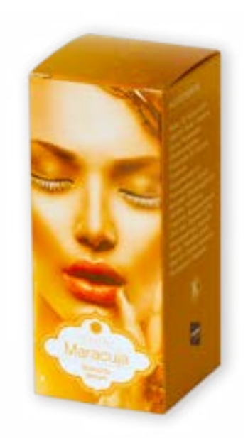
Create dramatic effects using HP Indigo ElectroInk White, on metallic, transparent and dark substrates.

Stand out and glow with HP Indigo ElectroInk Fluorescent Pink, offering high-value pages for greeting cards, promotional collateral, fashion applications, specialty products, publishing opportunities and more. For a wow effect, use UV lamps to make the fluorescent pink ink glow in the dark.