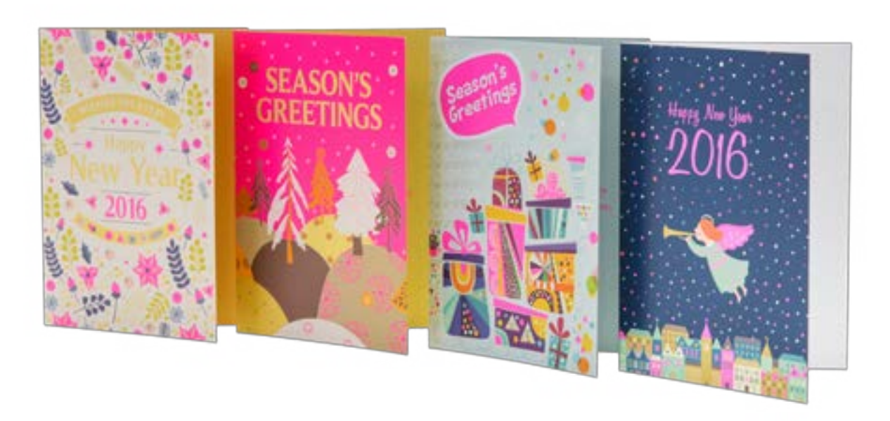
Offer high-value products with HP Indigo ElectroInk Fluorescent Pink.