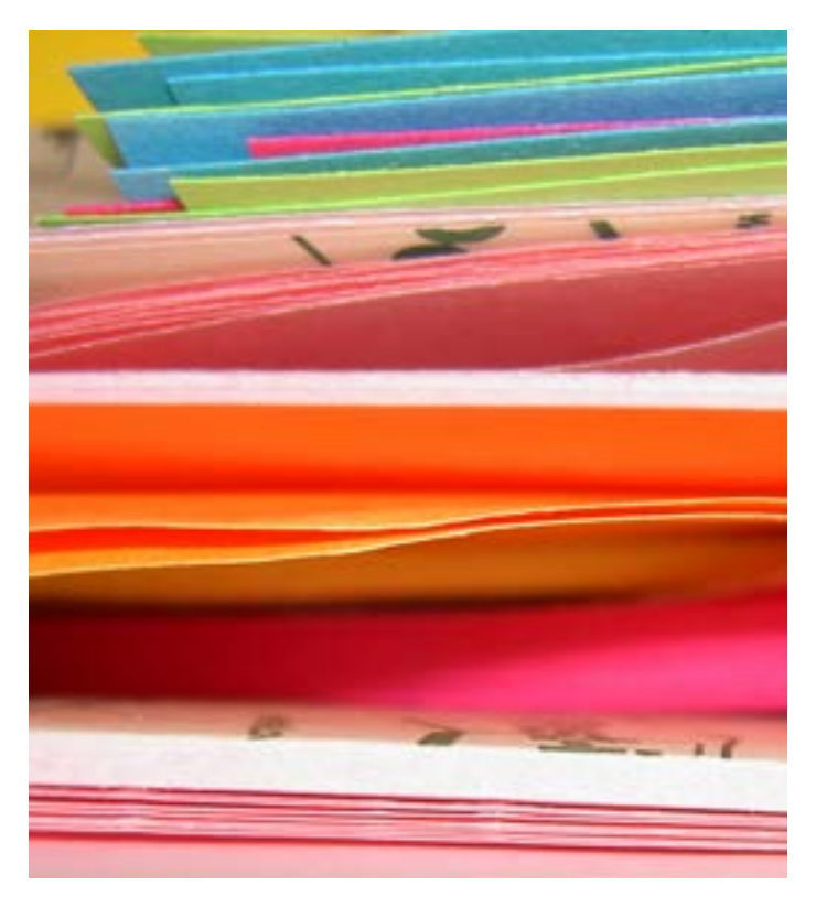
If there is a need to print on off-the-shelf stock including paperboard and specialty papers media, this can be achieved by the application of HP Indigo Electrolnk Primer.

With HP Indigo ElectroInk Invisible Red, customers can create jobs with text or barcodes that are visible only under UV light. Create text, images, and barcodes for various applications such as cards, direct mail, and in-house processing and control.