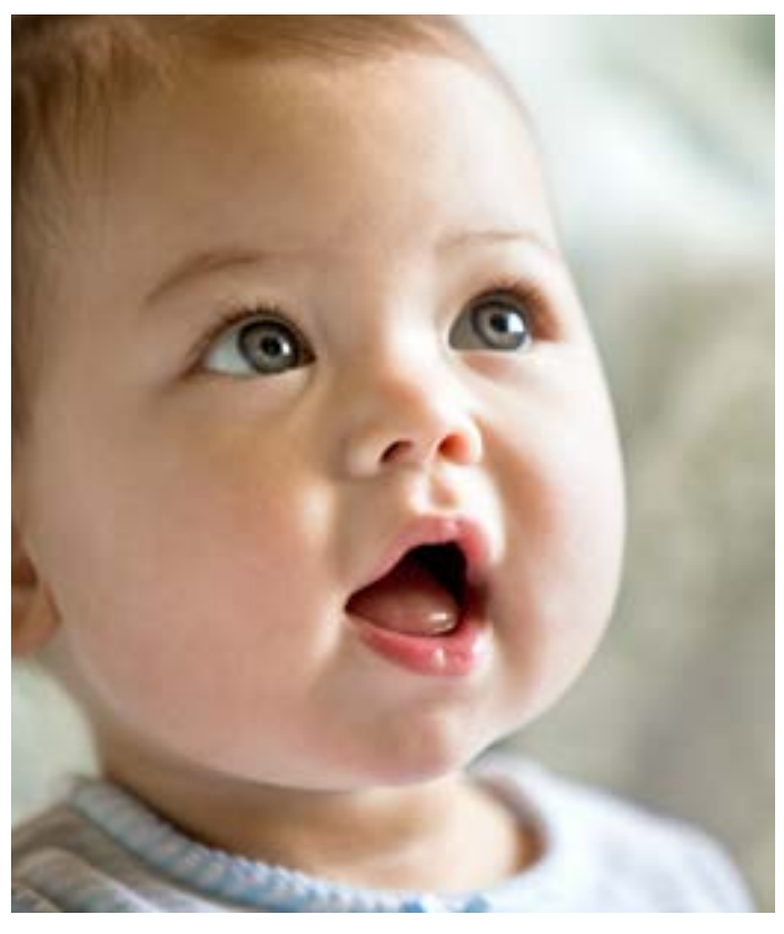
Use HP Indigo Electrolnk Light Cyan and HP Indigo Electrolnk Light Magenta for portraits to produce more natural skin tones.

Light black inks produce high-end monochrome photographic books and professional black-and-white photo prints. Achieve superior grayscale images for black and white photography and mixed colour and black and white imagery.