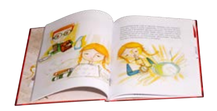
Print 33% faster using Enhanced Productivity Mode (EPM), while maintaining HP Indigo's vivid colours and high print quality.

HP Indigo offers the widest colour selection in the digital printing industry. By adding more on-press colour, in addition to special effect inks, texture, and spot colours to print capabilities, printers enjoy greater differentiation for themselves and their customers. And that means greater growth opportunities for digital printing business. These unique services can be offered by using up to 7 on-press ink stations. By adding more on-press colour and special effects, the value of the page increases tremendously, benefitting both printers and customers.