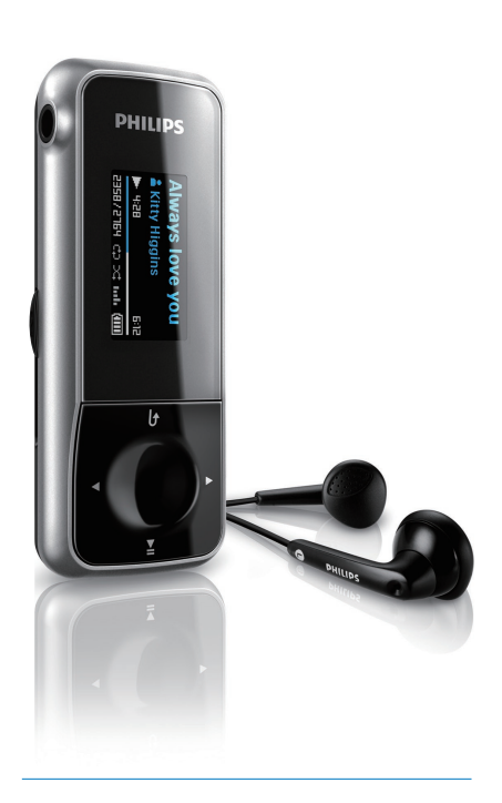
EN User manual