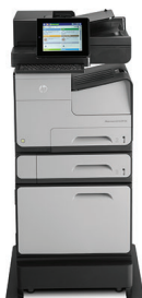
HP Officejet Enterprise Color Flow X585z MFP with optional paper tray and cabinet/stand