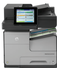
HP Officejet Enterprise Color X585dn Multifunction Printer

A printing revolution for your enterprise. HP Officejet MFPs deliver colour prints at up to twice the speed and half the cost per page of colour lasers – plus copy, scan and fax 1,2,3 . They're designed for advanced workflow – and built to last.