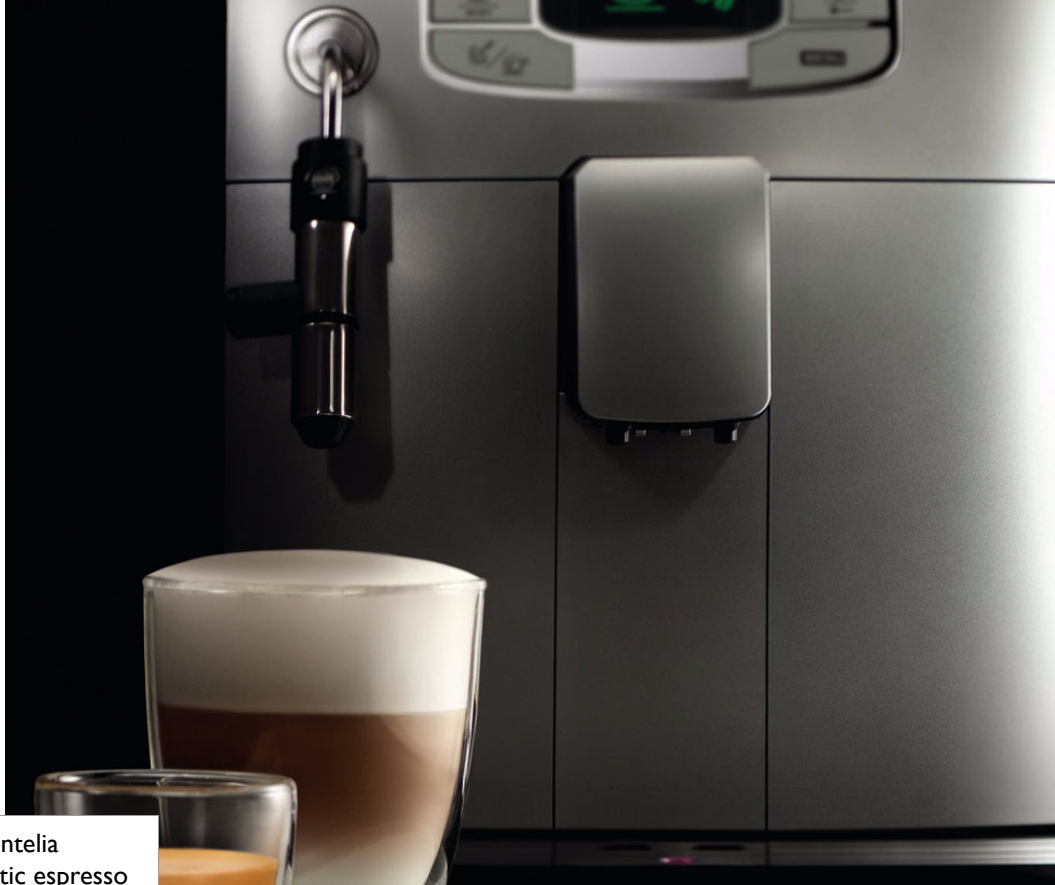
Philips Saeco Intelia Super-automatic espresso machine