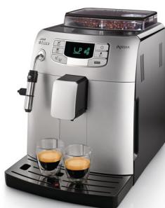
Automatic Milk Frother Silver