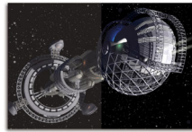
Without SmartImage GAME With SmartImage GAME

The new Philips gaming display has quick-access OSD fine-tuned for gamers, offering you multiple options. "FPS" mode (First person shooting) improves dark themes in games, allowing you to see hidden objects in dark areas. "Racing" mode adapts the display with the fastest response time and high colour, along with image adjustments. "RTS" mode (Real-time strategy) has a special SmartFrame mode that enables highlighting of specific area and allows for size and image adjustments. Gamer 1 and Gamer 2 enable you to save personal customised settings based on different games, ensuring best performance.