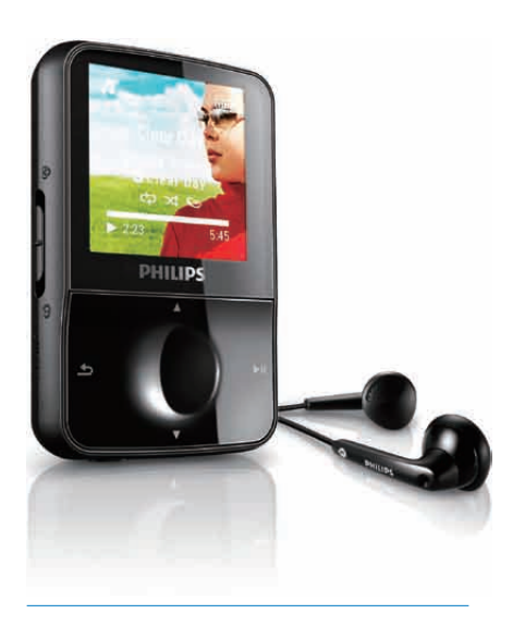
EN User manual