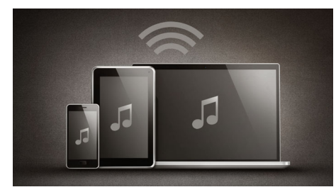
Bluetooth<sup>®</sup> (aptX<sup>®</sup> and AAC) for wireless music steaming