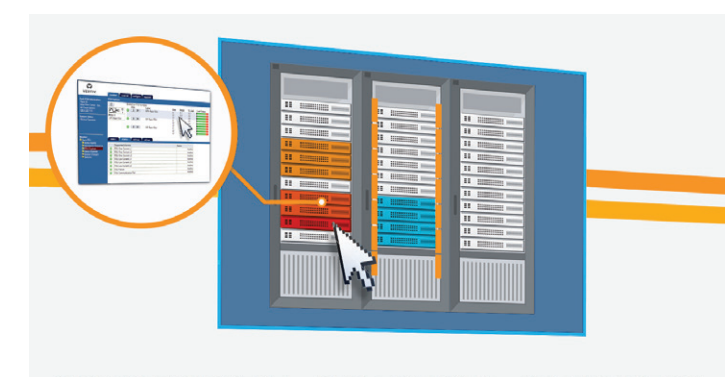
SUPPORT EQUIPMENT · REAL-TIME DATA · VIRTUALIZATION

MPX<sup>™</sup> and MPH2<sup>™</sup> rack PDUs allow real-time, highly precise metering and management – and the lowest energy consumption in the industry for rack PDUs.