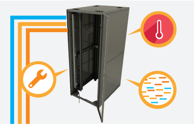
Your racks and equipment need a rack PDU that can address the challenges of rising power densities, heat, and serviceability.