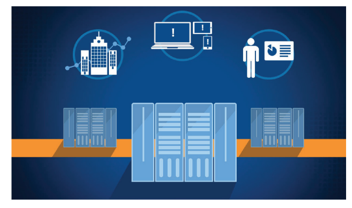
Many rack PDUs do not integrate with your network, security or infrastructure management systems – adding unnecessary complexity and cost, and restricting resiliency and agility.

And that would be very good for your business.