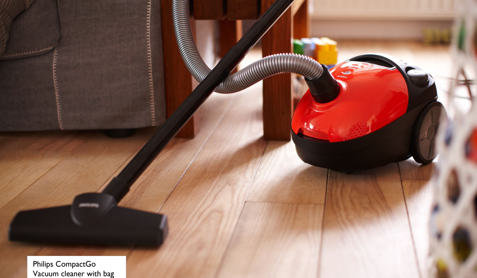
Philips CompactGo Vacuum cleaner with bag