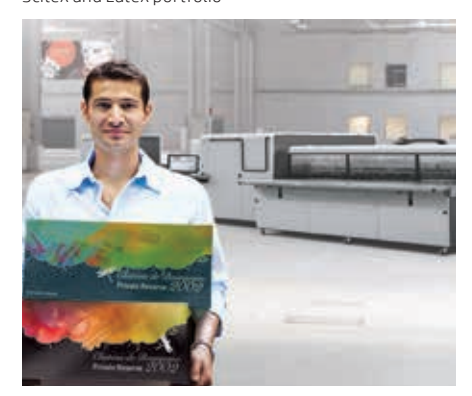
Data sheet | Customised Optimisation Services for Scitex and Latex portfolio