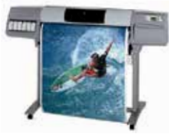
HP Designjet 5000/5500 Printer series