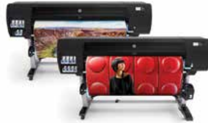
HP Designjet Z6800 Photo Production Printer HP Designjet Z6600 Production Printer