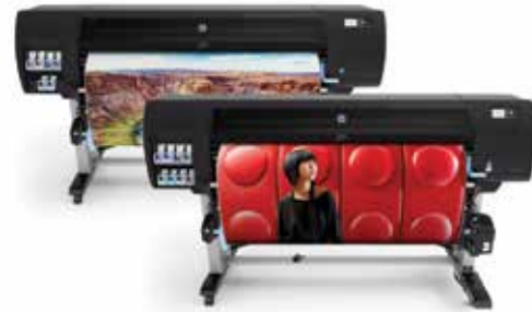
HP Designjet Z6800 Photo Production Printer HP Designjet Z6600 Production Printer