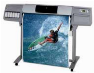
HP Designjet 5000/5500 Printer series

From the HP Designjet 5000/5500 Printer series to the HP Designjet Z6800 Photo Production Printer and the HP Designjet Z6600 Production Printer