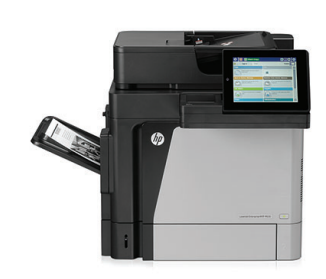
HP LaserJet Enterprise MFP M630dn

Rely on a full-featured HP Enterprise Flow MFP that streamlines digital workflow with advanced HP Flow solutions, safeguards business data and documents with a robust suite of top-flight security features and offers simple, efficient mobile printing.