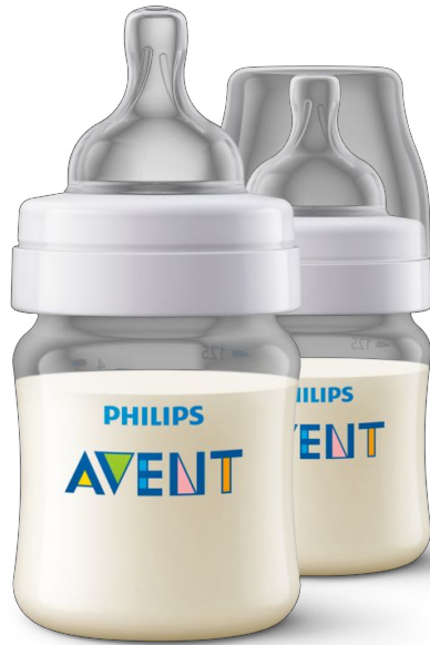
Classic+ baby bottle