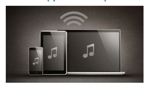
Bluetooth® (aptX® and AAC) for wireless music steaming